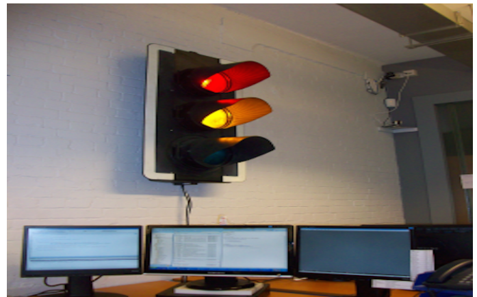
Fig. 2: Traffic light visualization for CI [4].

A development practice in Agile teams is continuous integration (CI). Since Agile teams work in small sprints, it is necessary for them to have working software everyday, and CI helps to make this possible. Automated tests are setup to